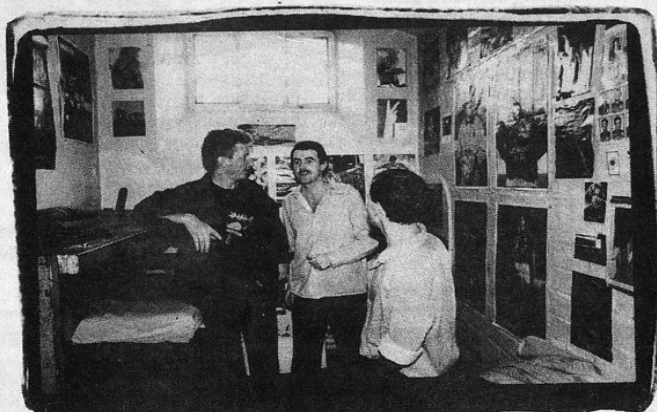
Bragg declines the invitation to stop over...