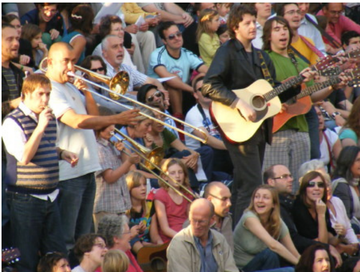
Members of the public were invited to bring their own instruments and join in